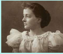
Maud Wood Park

Maud aided female voters by becoming the first president of 'League of Women Voters' and enforced a number of legislations to favor the rights of women in the society around 1918.