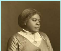
Mary McLeod Bethune